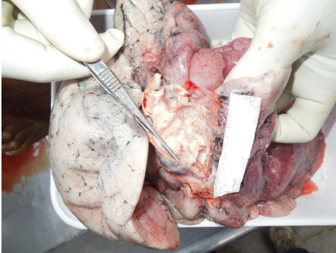
Fig 3: Aspirated food material in the right main bronchus

history of paranoid schizophrenia, which has been well controlled with Olanzapine, 20 mg/d, for many years. He was a known case of hypertension and ischaemic heart disease and was undergoing treatment at Regional Mental Hospital since four decades. The deceased while eating breakfast abruptly stood up and put his hand against his throat and collapsed. In spite of resuscitative measures he died within an hour of the onset of symptoms.