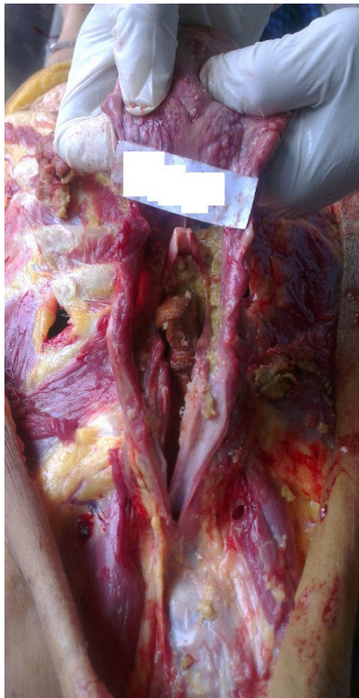
Fig 2: Piece of cottage cheese in infra glottic region

A 62 years old female corpse was brought for autopsy to the mortuary. She had a 22 year history of paranoid schizophrenia and was being treated with Olanzapine for many years. Two weeks ago, she had stopped taking her medication and was brought to a State run psychiatric hospital because of worsening paranoia and hostility. She was a known case of type II diabetes and poor dentition. She has no history of substance abuse. Just before her death, a few minutes after beginning her meal, she suddenly stood up and put her hands to her throat. She looked frightened, was not able to speak and became unconscious. She was then taken to the emergency department, where she was declared dead.