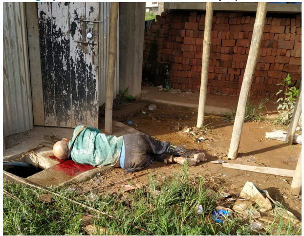
Photograph no 2: Contused abrasion over right parietal region of scalp.

Photograph no 1: Deceased with head injury