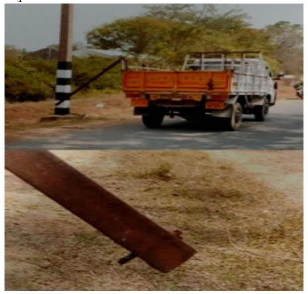
Figure 1: Iron rod with projecting screw being loosely suspended at the rear of the mini truck

She was immediately shifted to the nearest tertiar y care hospital where the initial trauma management was done and she expired within few hours of arrival at the hospital. The screw which had caused the injury had a grooving surface all along its length and was covered with dried blood stains. It had caused a penetrative pelvic injury which had resulted in severe haemorrhage and death of the pedestrian. On autopsy, the body appeared pale on general examination. On external examination a sutured lacerated wounds of size 5 cm X2 cm X bone deep on was present over the right gluteal region placed 4 cm lateral to the gluteal cleft and 10 cm below the posterior superior iliac spine.